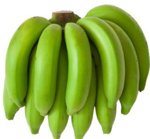
ECCB1 CAVENDISH BANANAS