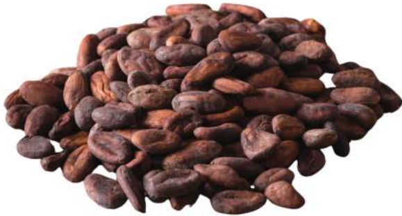
ECC3 G3 (GRADE 3) - UNCLASSIFIED / COMMON COCOA Theobroma cacao l.