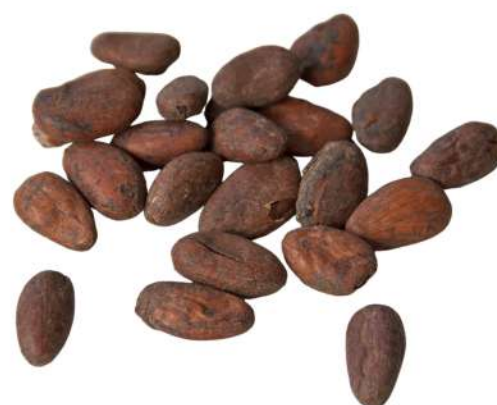
ECC2 G2 (GRADE 2) – CCN51 Theobroma cacao l.