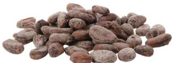
ECC1 G1 (GRADE 1) – FINE AROMA Theobroma cacao l.